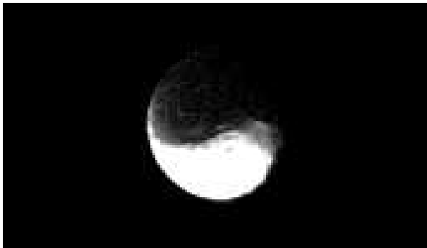
Fig. 2. Iapetus' image taken by Voyager-1 spacecraft.

Undoubtedly the strangest object in the solar system and maybe the best candidate for mirror object covered by ordinary crust is Saturn's another moon Iapetus [40]. It orbits not in a plane of the other moons. Its density 1.1 \text{ g/cm}^3 indicates that Iapetus must be composed almost entirely of water ice. Indeed its trailing hemisphere is very bright. But mysteriously the leading hemisphere is completely different — it is as dark as lampblack. See Fig. 2 which shows Iapetus as seen by Voyager-1 spacecraft.