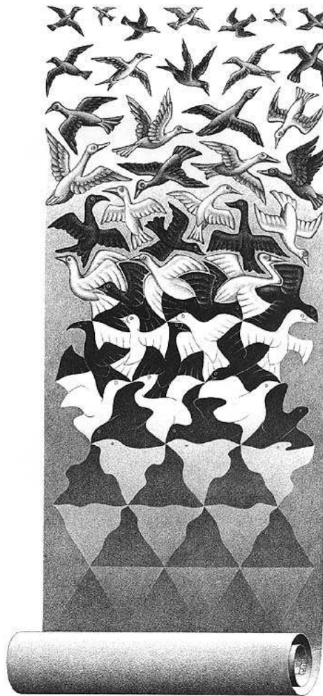
Fig. 1. The Brane World idea illustrated by M. C. Escher's lithograph "Liberation".

located on some 3-dimensional wall (a brane) in higher dimensional space. More precisely, only the gauge and matter particles are located on the brane. Gravity, in contrast, propagates into a full bulk and so is essentially high dimensional. But this high dimensionality of gravity is hidden at distances large compared to the size of extra dimensions. The localization of particles on the brane is not absolute: it takes place only at low energies. When energies are high enough compared to some characteristic scale the localization, as well as the brane, disappears and the world restores its high-dimensional nature for all degrees of freedom. A good illustration of the Brane World idea is M. C. Escher's lithograph "Liberation" shown in Fig.1.