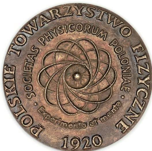
The face (top) and reverse (bottom) sides of the Memorial Centennial Medal of the Polish Physical Society, awarded at the Congress for the community service to the Society.