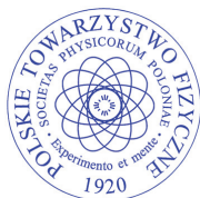
Polish Physical Society