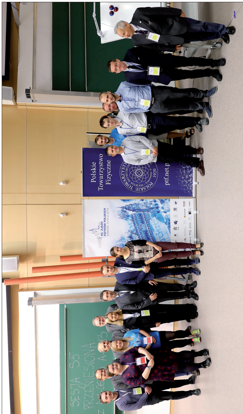
The Local Organizers and Staff of the 45 th Congress of Polish Physicists, Kraków, September 13–18, 2019.

The original photos are available on the webpage: http://www.45zfp.uj.edu.pl/#/po-zjezdzie/galeria